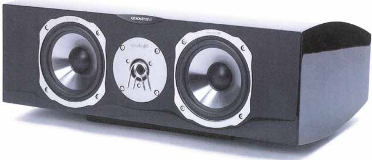
The Signo Avantgarde 10 Base Center sits inside a shell. This enables the vertical radiation angle to be adjusted.

tion surface with a radial design. Two silvery guards are fitted to protect the sensitive membrane against mechanical damage. These are bonded onto the plastic front-plate and they cannot be removed. The subwoofer is responsible for the dramatic deep bass reproduction in a home cinema set. A Qube 10 Active subwoofer was responsible for the long-wave conversion in the Quadral set sent to