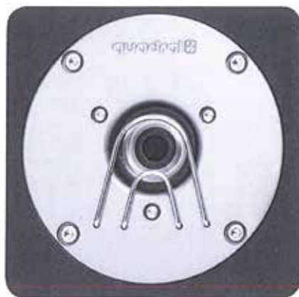
The tweeter has two metal guards fitted to it to protect the sensitive radiation surface

us. As you can tell from the name, the cube-shaped bass speaker uses a ten inch cone. This is integrated in a bass reflex case and radiates downwards against the surface it is sat on. The Qube 10 is enthroned on thick, angular feet so that the gap between it and the floor can be set correctly. At the back of this active model you will find a 280 Watts digital power amplifier as well as all of the important controls and connections. In addition to the obligatory volume and separating frequency controls there is also a phase switch for correcting the runtime. There are two pairs of cable terminals available for connecting up a stereo amplifier without low-level outputs. A power-saving stand-by circuit rounds off the configuration.