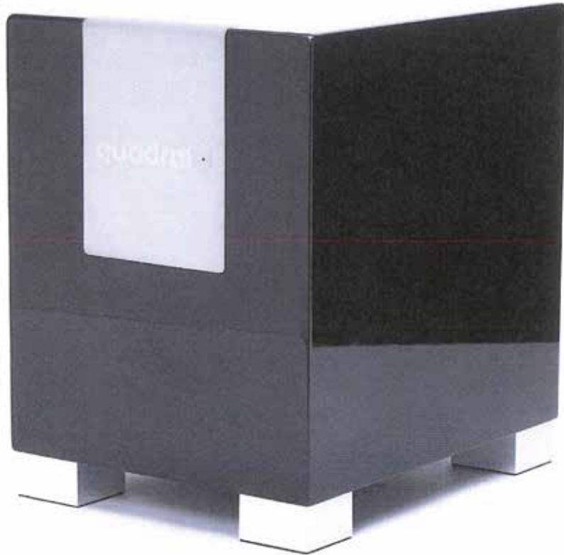
The Qube 10 active subwoofer is responsible for producing the necessary bass punch.

cone chassis. The housing has been designed using the reflex principle in order to optimise the low frequency performance capabilities. The sound produced by the subwoofer is fed out to the rear through a precisely calculated tunnel area. The bass range of the speaker is extended by the deep tuning frequency of the reflex channel. A 28 mm tweeter is used for the upper frequency ranges. This has a radia-