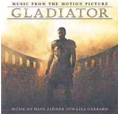
Film music: Gladiator

vidual instruments. The tonal tuning is typical Quadral as it is pleasantly rounded and harmonic. None of the frequency ranges became prominent, so that this set of speakers can also be recommended without exceptions for use in modern lounges without excessive furniture and a lot of noise reflecting surfaces.