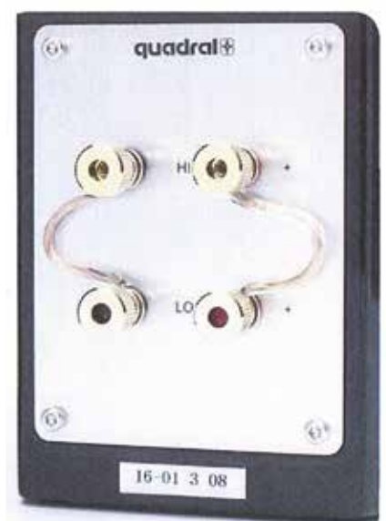
The top quality cable connections have been designed to guarantee optimum signal transfers

ing the in-depth testing. Our test set was finished in black. Quadral also offers a version finished in white as an alternative. Both colour versions are fitted with black front grilles. They are made from a finely meshed material. As a magnetic attachment system is now used, the customary fastening sockets in the baffle are no longer needed and this heightens the appearance of the components in this Signo Avantgarde set. The tweeter, mid-range unit and woofer all have silver-grey chassis cradles, which skilfully offsets them against the dark finish of the case. A dominant visual design feature of the new range is the rounded, V-shaped guards fitted on the outside of the tweeter's sensitive radiating surface.