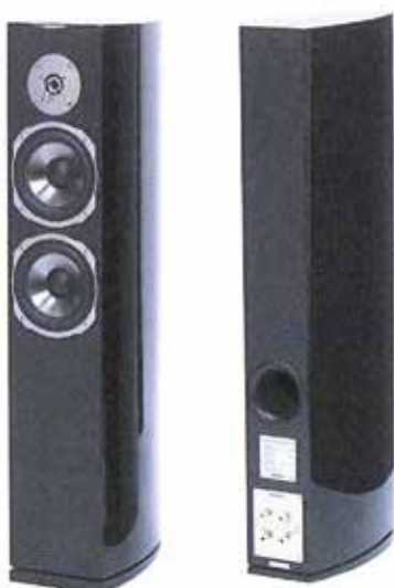
The curved sidewalls give the Quadral Signo Avantgarde speakers an elegant and powerful appearance