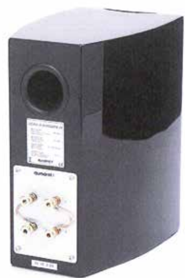
The Signo Avantgarde 20 is used as the effects speaker

ing the in-depth testing. Our test set was finished in black. Quadral also offers a version finished in white as an alternative. Both colour versions are fitted with black front grilles. They are made from a finely meshed material. As a magnetic attachment system is now used, the customary fastening sockets in the baffle are no longer needed and this heightens the appearance of the components in this Signo Avantgarde set. The tweeter, mid-range unit and woofer all have silver-grey chassis cradles, which skilfully offsets them against the dark finish of the case. A dominant visual design feature of the new range is the rounded, V-shaped guards fitted on the outside of the tweeter's sensitive radiating surface.