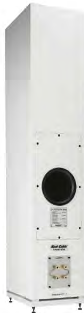
A large rear bass port provides in-room response down to 25Hz.

Bass response is also impressive. There may not be the visceral slam of a 12-inch driver but the large rear port enables the M50s to go impressively low when the music demands. The beginning of Bach's 'Passaglia in C Minor' spirals down with real power through the Quadral's until its final organ note hits you with the