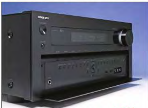
ONKYO TX-NR828 EXCLUSIVE! av receiver

FREE READER CLASSIFIED ADS IN THIS ISSUE!