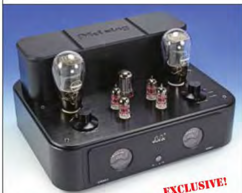
MING DA DYNASTY DUET 300B EXCLUSIVE! single ended integrated amplifier