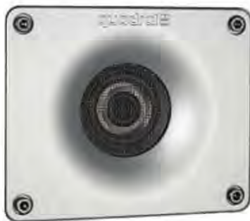
Quadral's new RiCom-V ring dome tweeter gives an exceptionally smooth and flat response.

treble, low-end power, mid-range detail or out-of-the-box imaging. Only a special few manage to put it