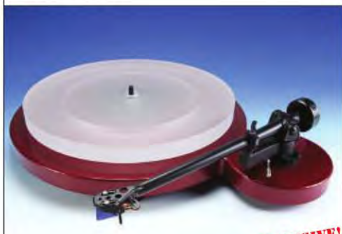
INSPIRE BLACK MAGIC Si EXCLUSIVE! turntable