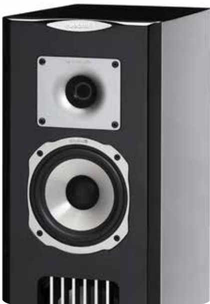
Quadral's RiCom V tweeter uses a high-strength titanium membrane