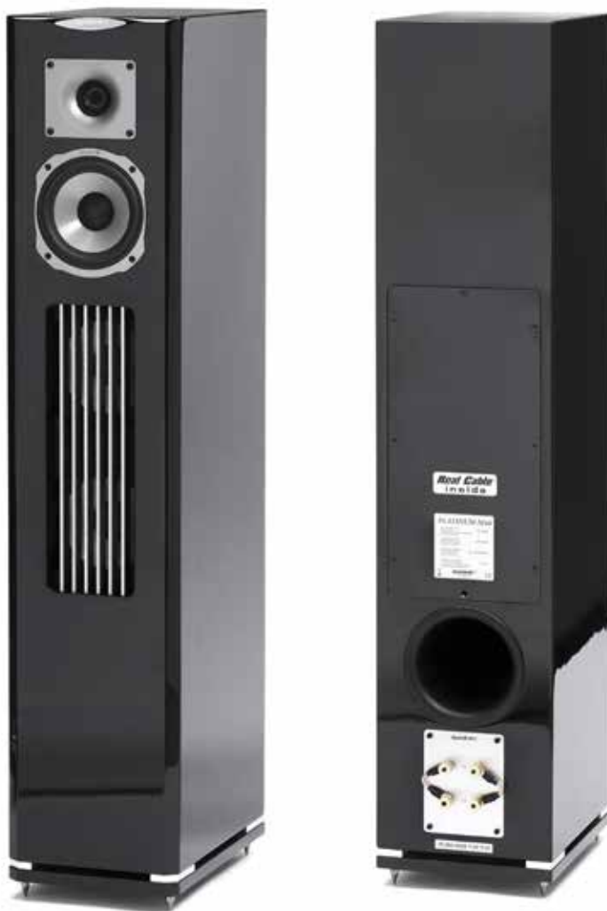
The Quadral Platinum M40 is available in high-gloss black or white finishes

The Quadral Platinum M40 is a medium sized upright box that stands one metre tall. You will be delighted with the impressive proportions right from the very first time that you see this box. The housing width of 21 cm and the one metre height ensure that it is extremely stable and they also give it an air of self-confidence. The large housing edges are cleanly shaped and they are a good example of the conscientious workmanship involved in the production. The same applies to the fastidiously hollowed out chassis openings, which enable the tone units to be recessed in the baffle. The finish on our test unit was evenly applied and prepared correctly. The high-gloss surface further reflects the proverbial high material and appealing qualities of the Platinum M40. The customer can choose between the two black or white high-gloss colour variations in order to suit personal tastes and interior decor. Magnetic black fabric covers are included in the package with both versions. If you want you can have optional white front grilles fitted to the speaker.