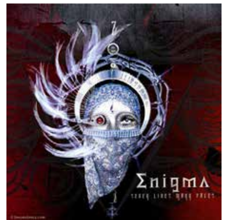
Enigma: Seven Lives, many Faces

Fastidious jazz and classical music fans will really appreciate the harmonic, natural yet potent sound character of the M40.