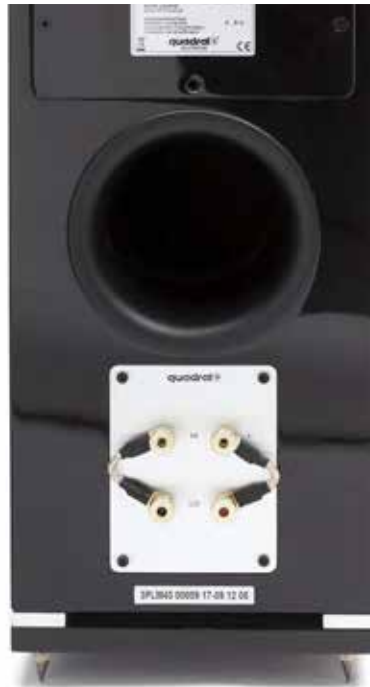
At the back you will find top quality cable connector panel and a bass reflex tube

A 135 mm cone is used for the mid-tone ranges and it works with an aluminium membrane. The working range of the chassis lies between 320 and 2,450 Hertz. Quadral's recently developed RiCom V tweeter, which needed more than two years development work before it was ready for production, is also used here. The tweeter, which is equipped with an extremely stable titanium membrane, is able to reproduce the most delicate details