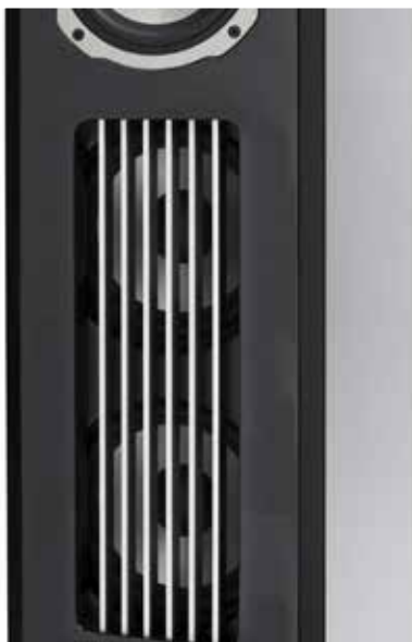
Two 17 cm woofers work behind the front bars